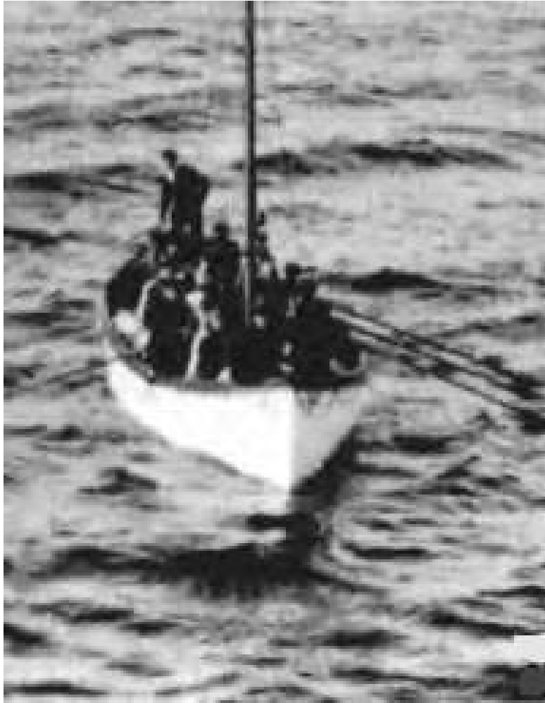
Lifeboat No. 14

This photograph of No. 14 is too dark to count individual passengers, but plainly shows that the boat was far from full when it approached the Carpathia .