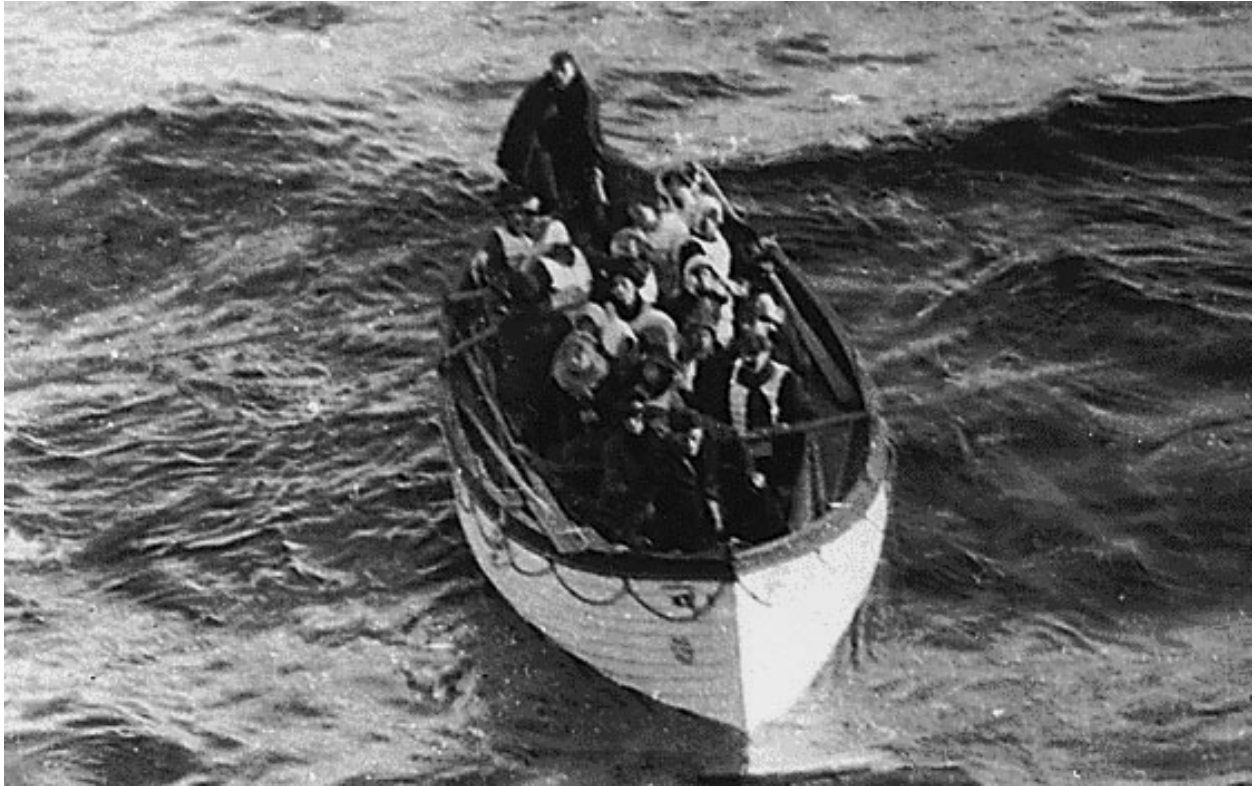
Picture A Lifeboat No. 6 approaching Carpathia