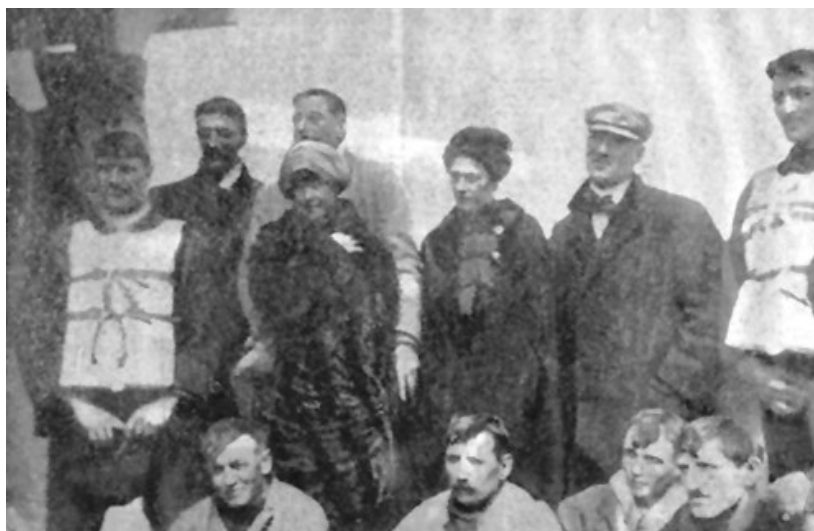
The small group of survivors rescued in Boat No. 1 posed together onboard the Carpathia for this picture.